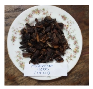
Chart-I. Mushroom Jerky (chilli).