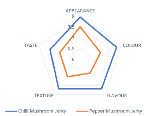
Fig. 1. Estimated mean values sensory attributes of chilli and pepper Mushroom jerkies .

Through Hedonic scale, the sensory characteristics like appearance, colour, flavour, texture and taste were evaluated and given in the Fig. 1.