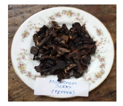
Chart-II Mushroom jerky (Pepper).

The sensory attributes were evaluated like appearance, colour, flavour, texture and taste using 9 -1-point hedonic scale. All parameters were above dislike nor like only. The scores of mushroom jerkies were 7.95 and 7.50; 7.78 and 7.00; 7.69 and 6.79; 7.69and 7.00, 7.47 and 7.00 for chilli and pepper treated jerky respectively. The chilli treated mushroom jerky found to be good in taste than the pepper treated one. The difference between two methods is very meagre. Nonsignificant change (p<0.05) in almost all the parameters and the steps were successfully established in this study to minimise changes in quality attributes. The same was reflected in the mean preference scores of 50 panels which was shown in the Fig. 1. However, treating with marinade increases the sensory attributes and evidences shown by (Grahl et al., 2018) are also on par with the studies.